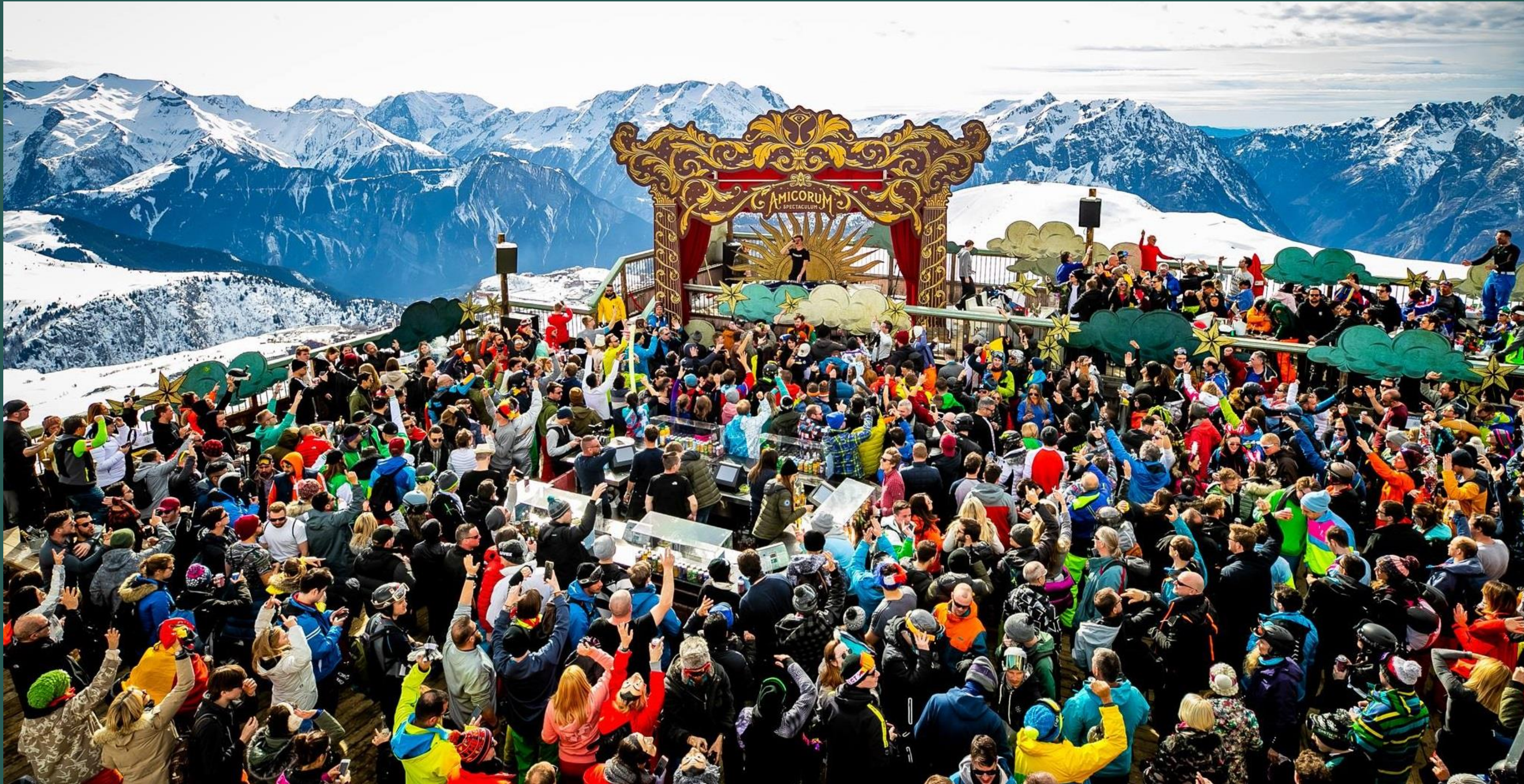
The main stage « Amicorum Spectaculum » at the Tomorrowland Winter 2019 festival.