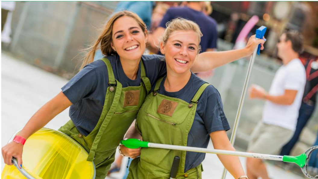
The team in charge of the recycling.