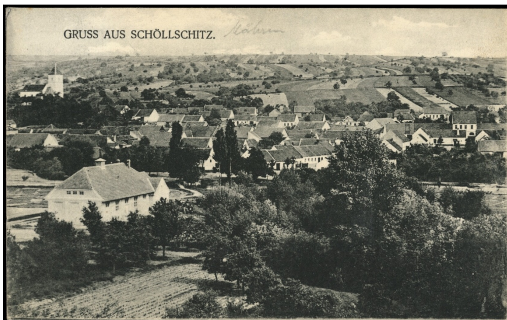
Želešice ( Schöllschitz ) with the gymnasium in the foreground left, postcard