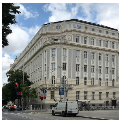
Prager Eisenindustrie, Wien (2022)