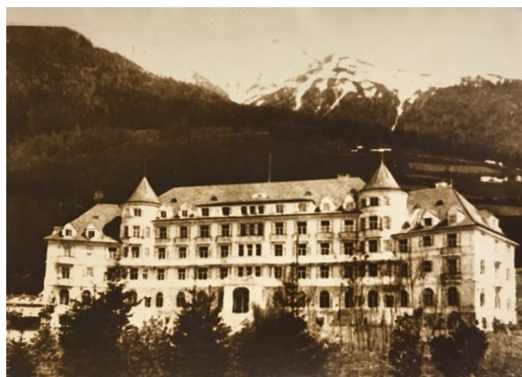
Hotel Wielandhof before completion, ca. 1912, private collection, Colle Isarco