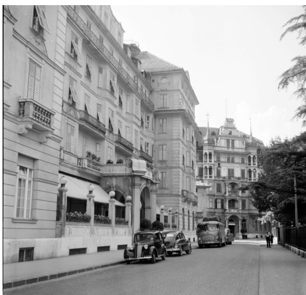
Hotel König Laurin, ca. 1950

In course of the realization of projects in Bolzano, e.g. the Hotel König Laurin, there was sometimes close cooperation with the company Zimmerhackel & Quaiser, which also worked in architecture and construction from 1910 to 1920. 27