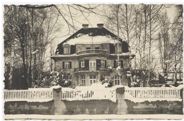
Villa Thomas Mann, ca. 1930