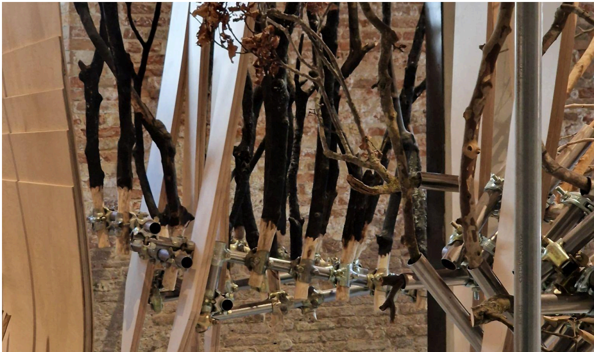
(image: Mümün Keser → Luciana Lamothe , “ Ojalá se derrumben las puertas ”, Venedig 2024)

As a participating student you will be tasked with selecting a project as a site from a group of reference projects with the lost identity. The challenge lies in metamorphosing this chosen edifice into a contemporary or even futuristic architectural proposal. Through this studio, students will be challenged to push the boundaries of traditional architecture, exploring new dimensions of design that are informed by both the material and immaterial facets of the space by using contemporary design tools. The anticipated outcomes are not only innovative architectural proposals but also thoughtful responses to the complex questions of how we can honour the past while building for the future. This reviving process should be grounded in sustainability, ensuring that the revival of these spaces is environmentally responsible, resilient, and forward-thinking. Thus the material of choice for each project should be primarily wood or wood-based derivatives and materials found on site.