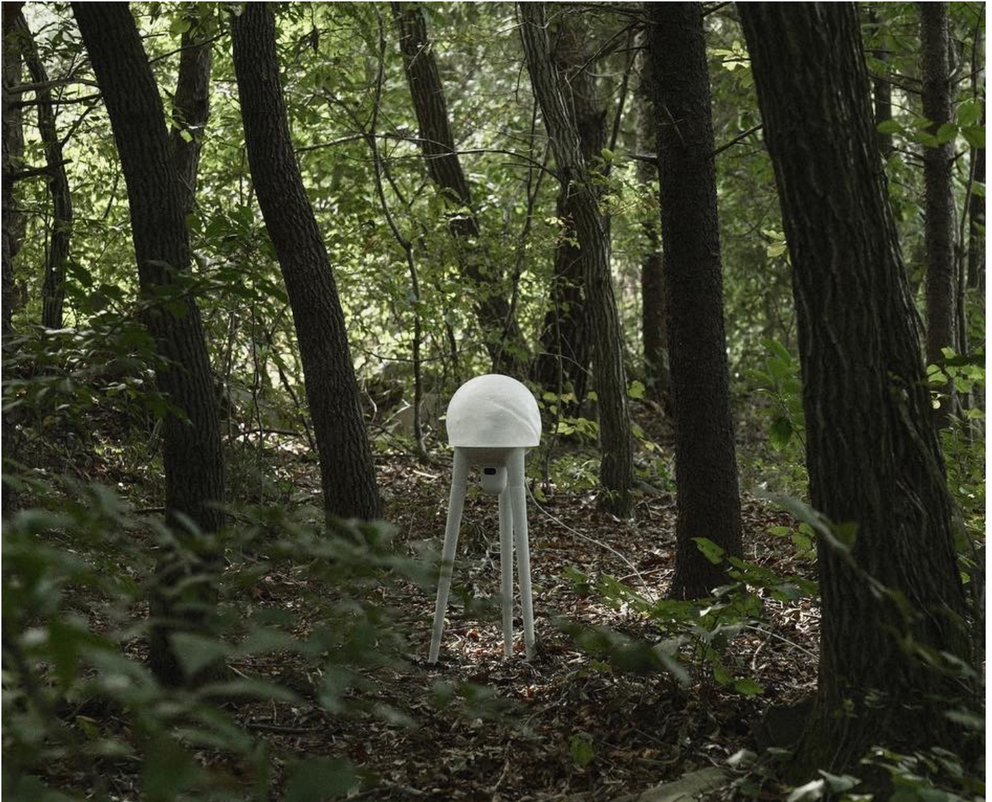
Inscape - Sonantian by artist Kohui Audiovisual installation / Hardware, mixed media (2022)