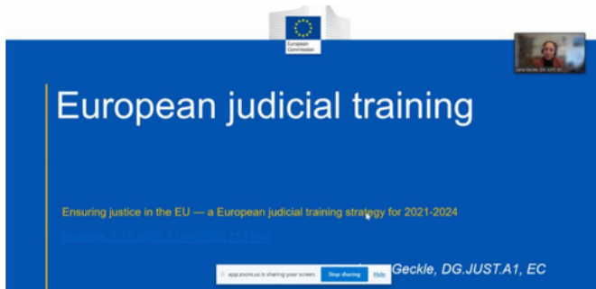
EU Policy Officer at the European Judicial Training Unit, presented the core of the European Commission (EC)

In this regard, another interesting point that emerged from the IVC concerns precisely the need for direct contact with foreign counterparts . Speakers from Belgium, Germany, the Netherlands, and Poland stressed the relevance of direct contact, i.e. by meeting foreign colleagues to discuss,